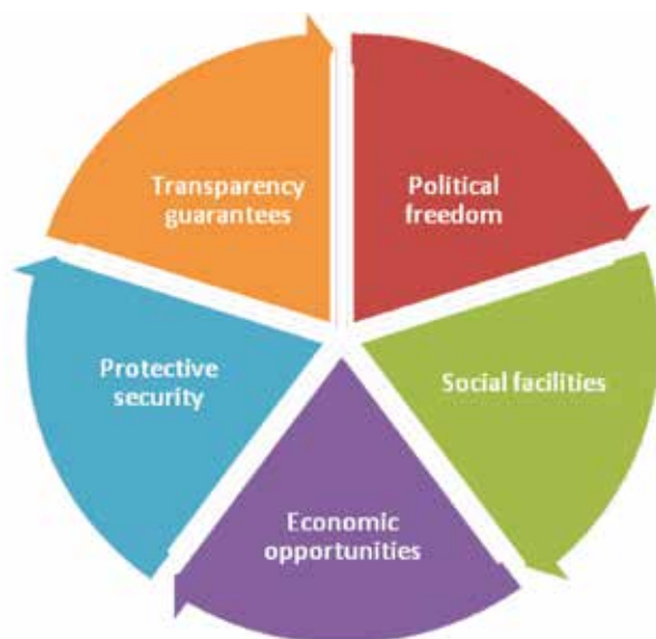
Figure 1: Sen’s multidimensional capability approach (CA)

Political freedoms refer to people’s the need to have a voice and to be heard.